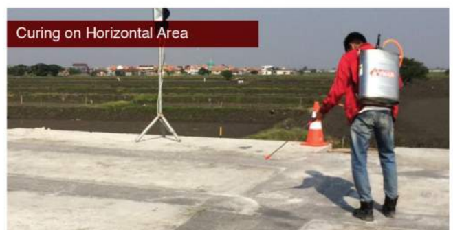
Curing on Horizontal Area

Consol Cure E White is sprayed on to newly concrete surface to form a thin film barrier against premature water loss. Without disturbance to the normal setting action, the concrete is then allowed to cure and achieve maximum properties.