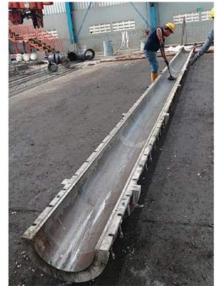
① CONSOL FORM OIL SERIES Mold release agent