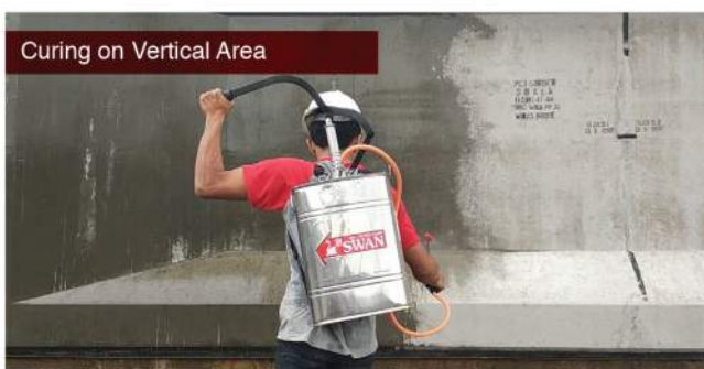
Curing on Vertical Area